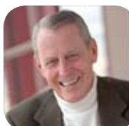
Thomas E. Starzl

Thomas Starzl is widely regarded as the father of transplantation, having performed the first successful liver transplant in 1967. Concurrently, he was also pivotal in establishing successful kidney transplantation.