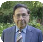
Roy Calne www.laskerfoundation.org/awards/2012clinical.htm

Starzl's lifetime work was recognised in September this year when together with another pioneer in the field of transplantation, Roy Calne, he was awarded the Lasker-DeBakey Award for his revolutionary contributions to clinical medicine; this was the first time ever that the Lasker Foundation had recognised work in the field of transplantation when considering potential recipients, perhaps because it is so difficult to isolate an individual that stands out so far above the rest. The award is most pertinent however: it highlights once again that in fact it is not individuals who make transplantation successful, but rather physicians like Starzl whose enormous energy in furthering the education of young doctors of the future, allows continuity, and leave a legacy well beyond their passing.