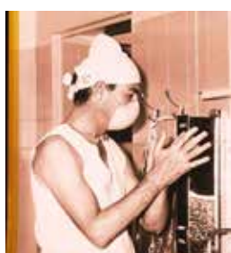
Prof. Christian Barnard prepares for surgery

1am on the morning of the 3 December. Prof. Barnard started the transplant at 2am and finally got the new donor heart beating at exactly 5:58 am – 3 hours and 58 minutes after starting the operation.