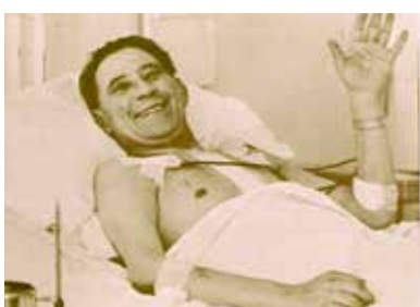
Mr Louis Washkansky, first successful heart transplant recipient