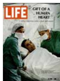
The world's first successful human heart transplant surgery made headlines all over the world

Mr Washkansky recovered very well and was pleasantly surprised at his easy breathing. He had a good appetite and joked with the nurses. Unfortunately, being a 40 cigarette a day smoker, his condition started deteriorating and the team decided that it could be rejection. He was given extra immunosuppressant but in actual fact, they later found out the problem