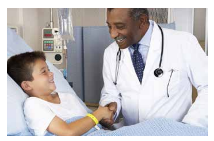
Referral of a patient for assessment for possible transplant listing implies referral to a multi-disciplinary unit responsible for review.

6. Miscellaneous conditions. Other rarer lung conditions may progress to end stage lung disease and may be considered for lung transplantation. Sarcoidosis, pulmonary histiocytosis of the Langerhans Cell-type, and lymphangioleiomyomatosis (LAM) are rare disorders we have encountered and successfully transplanted.